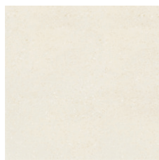
HN VERSALIA BEIGE