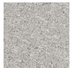
HN VERSALIA ASH