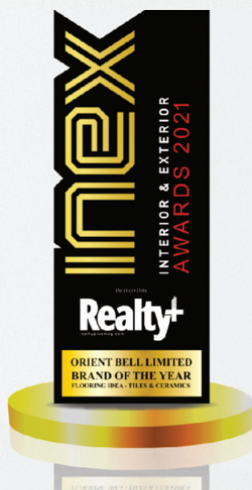
Brand of the Year-Jan 2021 (Flooring Idea-Tiles & Ceramic)