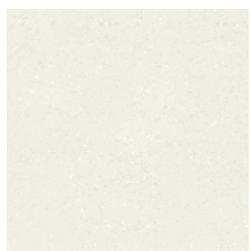
HN VERSALIA WHITE