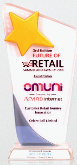
Customer Retail Journey Innovation Winners Future of Retail Summit & Awards 2020