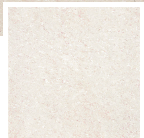
HN VERSALIA ROSA 800x800 mm