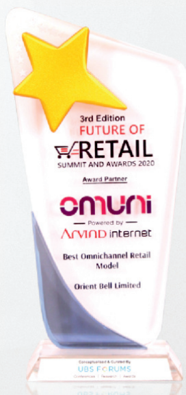
Best Omnichannel Retail Model Winners Future of Retail Summit & Awards 2020