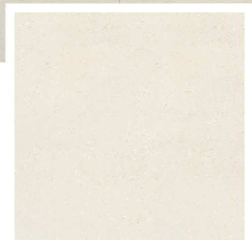
HN VERSALIA BEIGE 800x800 mm