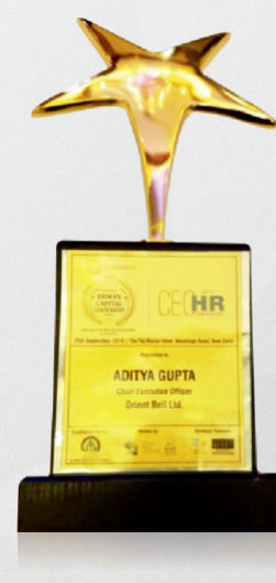
CEO with HR Orientation ZEE BUSINESS National Human Capital Leadership Congress & Awards