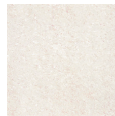
HN VERSALIA ROSA