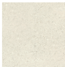
HN VERSALIA SANDUNE