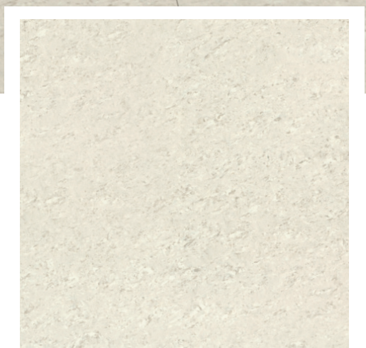
HN VERSALIA SANDUNE 800x800 mm