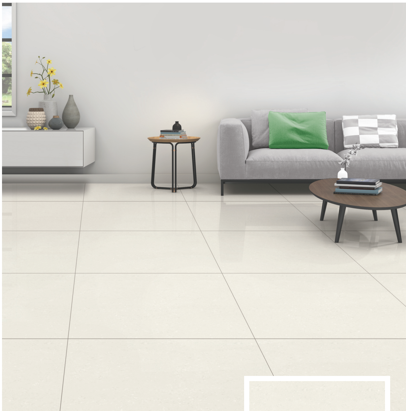
HN VERSALIA WHITE 800x800 mm