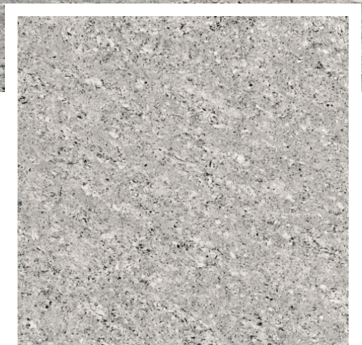
HN VERSALIA ASH 800x800 mm